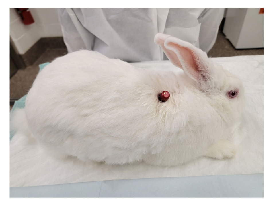
Figure 4. Vascular access button with protective magnetic cap.