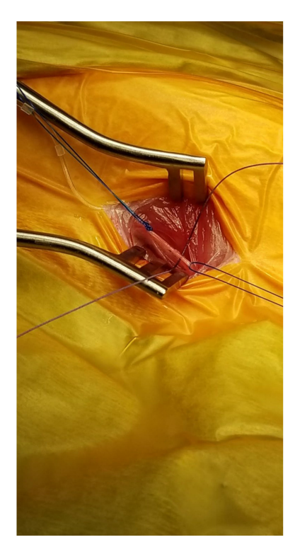
Figure 2. Isolation of femoral artery for catheterization.

Both skin incisions were closed in a similar fashion. The subcutaneous tissue was closed with a monofilament absorbable suture material, 3-0 PDS (Ethicon, Guaynabo, Puerto Rico), in a simple continuous pattern. The subcuticular layer was closed using a monofilament absorbable suture material, 4-0 PDS (Ethicon, Guaynabo, Puerto Rico), in an inverted interrupted pattern. A local block, 0.25% bupivacaine (Hospira, Lake Forest, IL,