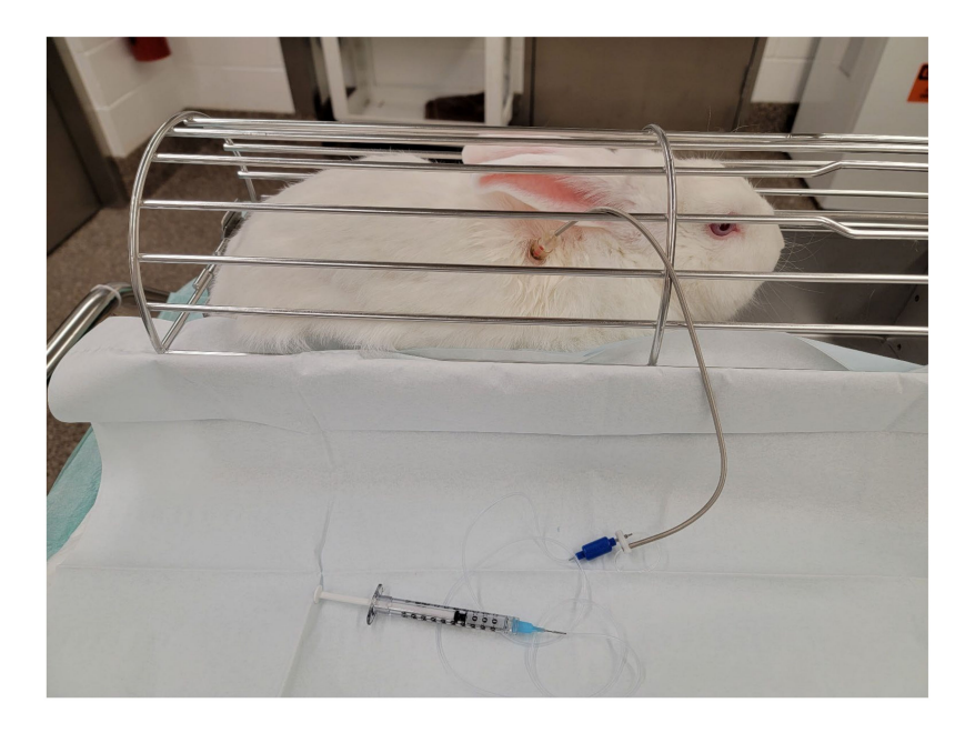
Figure 5. Use of a VAB and magnetic tether during a PK study.